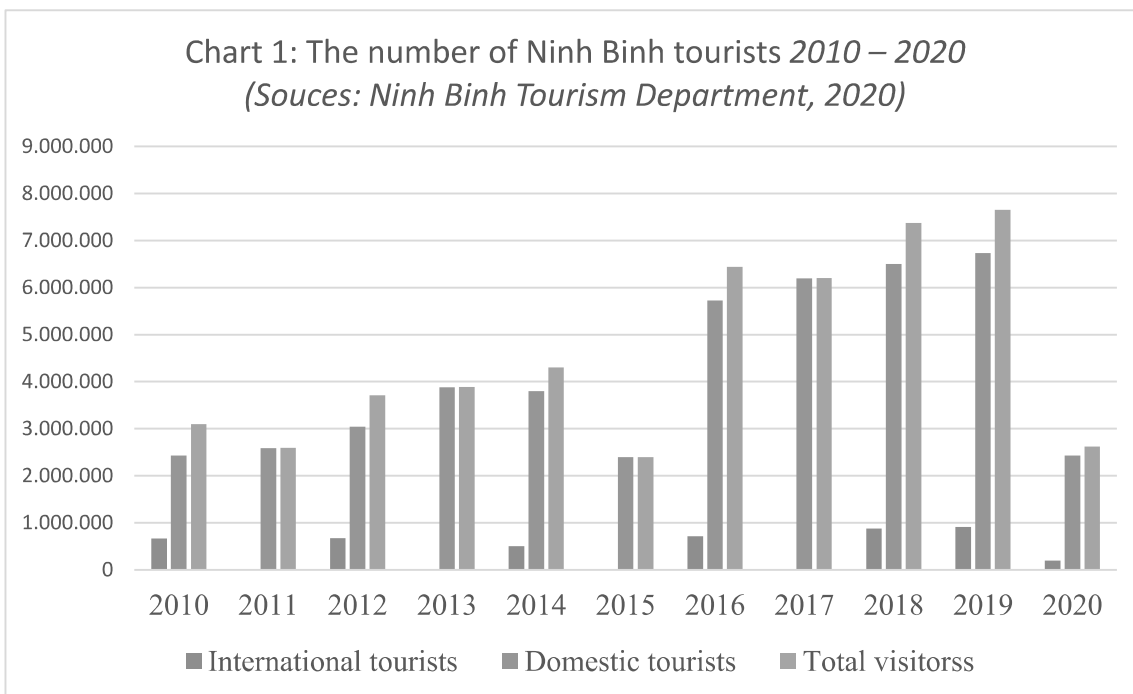
Chart 1: The number of Ninh Binh tourists 2010 – 2020

Ninh Binh tourism must depend about COVID-19 of Vietnam and the effectiveness of future COVID-19 vaccines. All the data about tourism performance was collected in government public data and will be analyzed in the next paragraph.